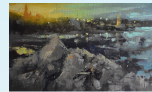
DAVE WEST: SMALL WORKS 1ST DEC-20TH JANUARY 2025